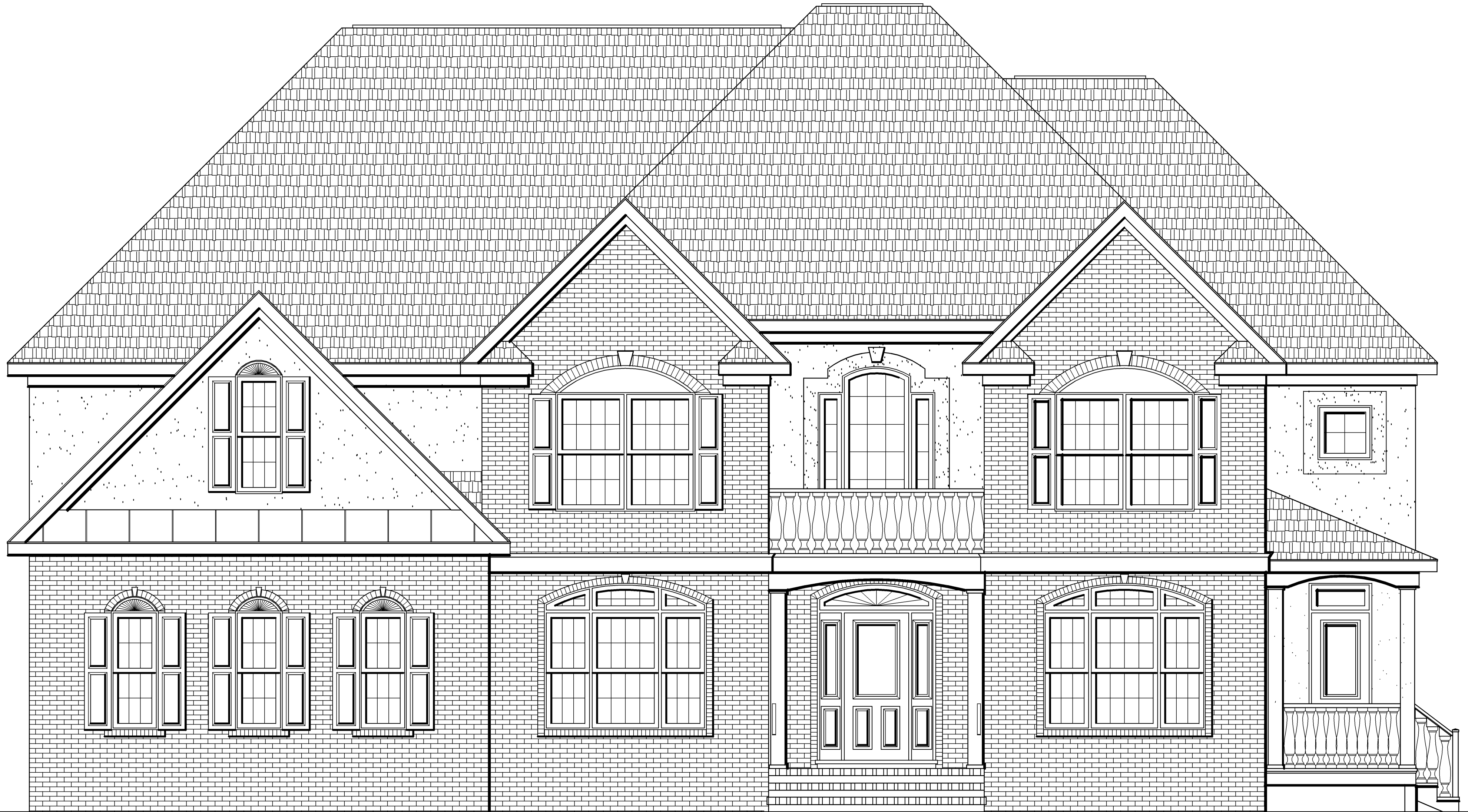
FRONT ELEVATION "THE WOODLAND" — 3,350 S.F.