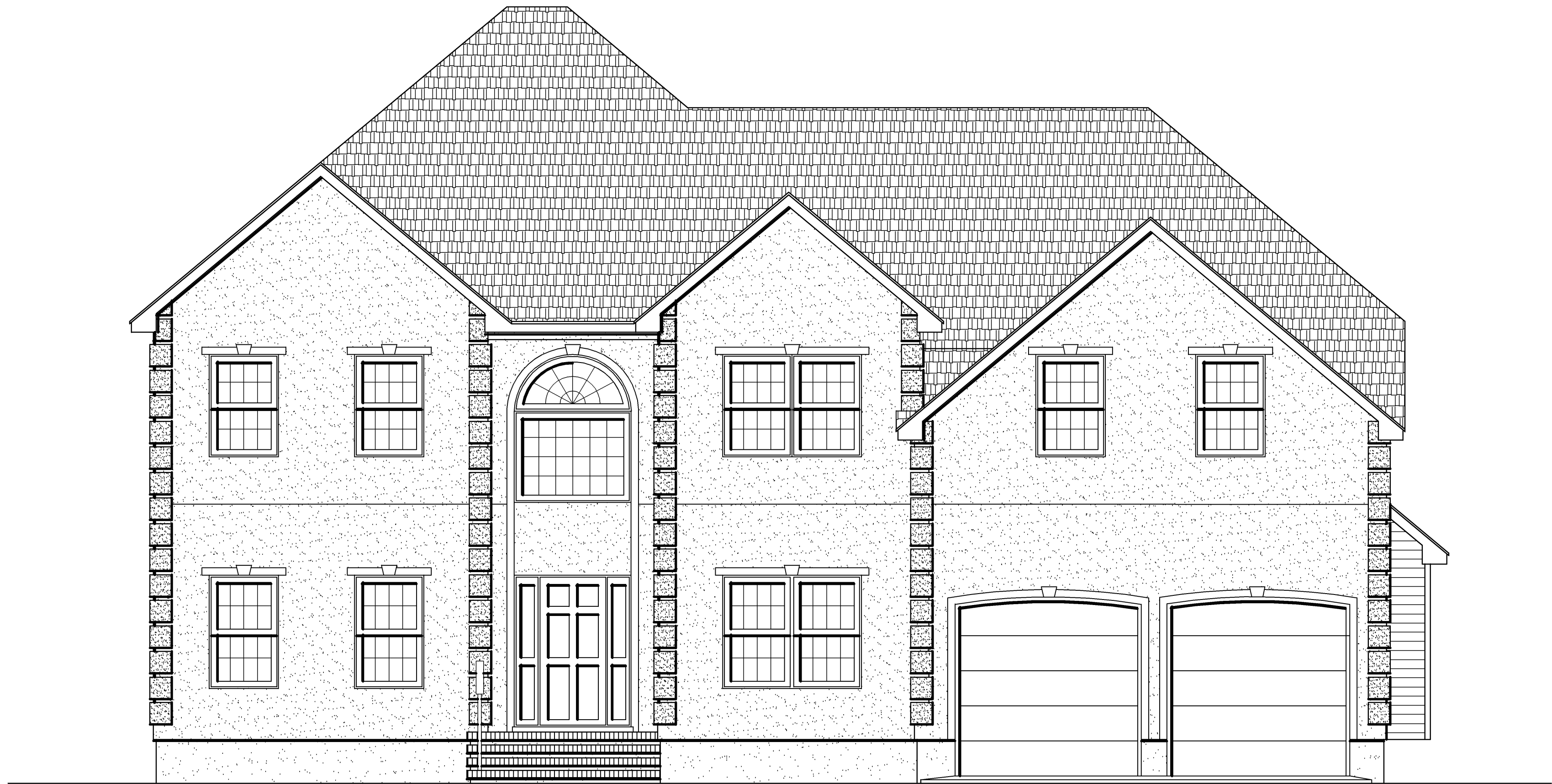
FRONT ELEVATION "THE WESTMINSTER" — 3281 S.F.