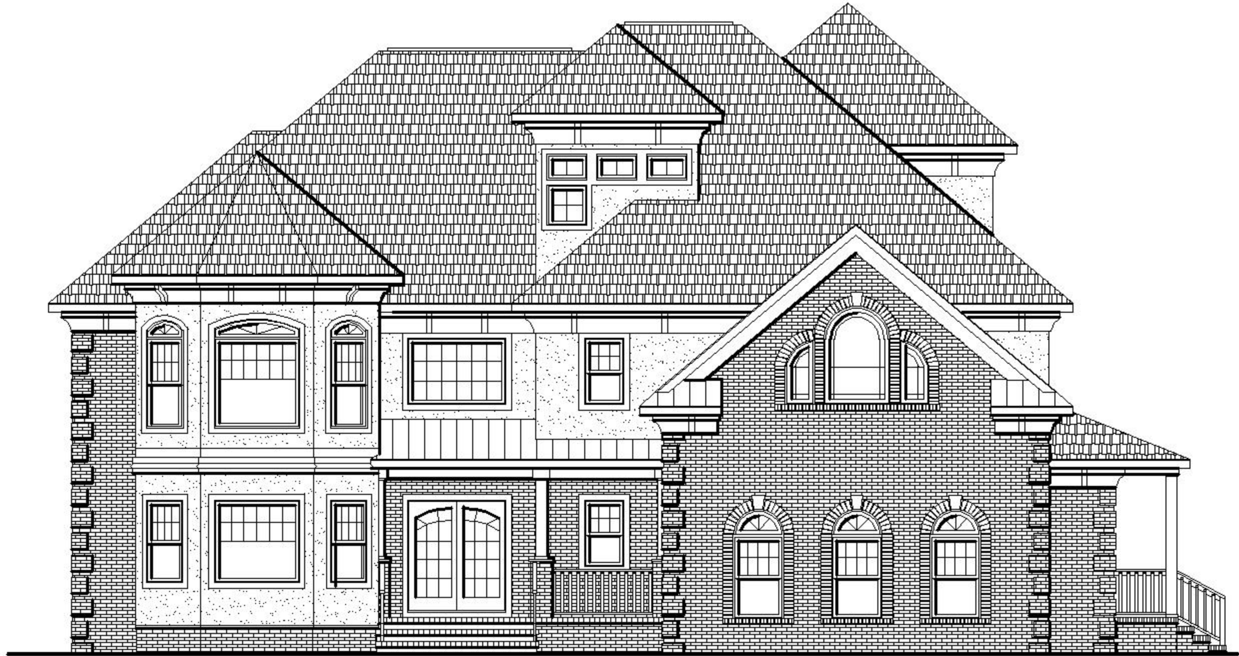
FRONT ELEVATION "THE MADISON" - 4,388 S.F. (THIRD FLOOR - 495 S.F.)