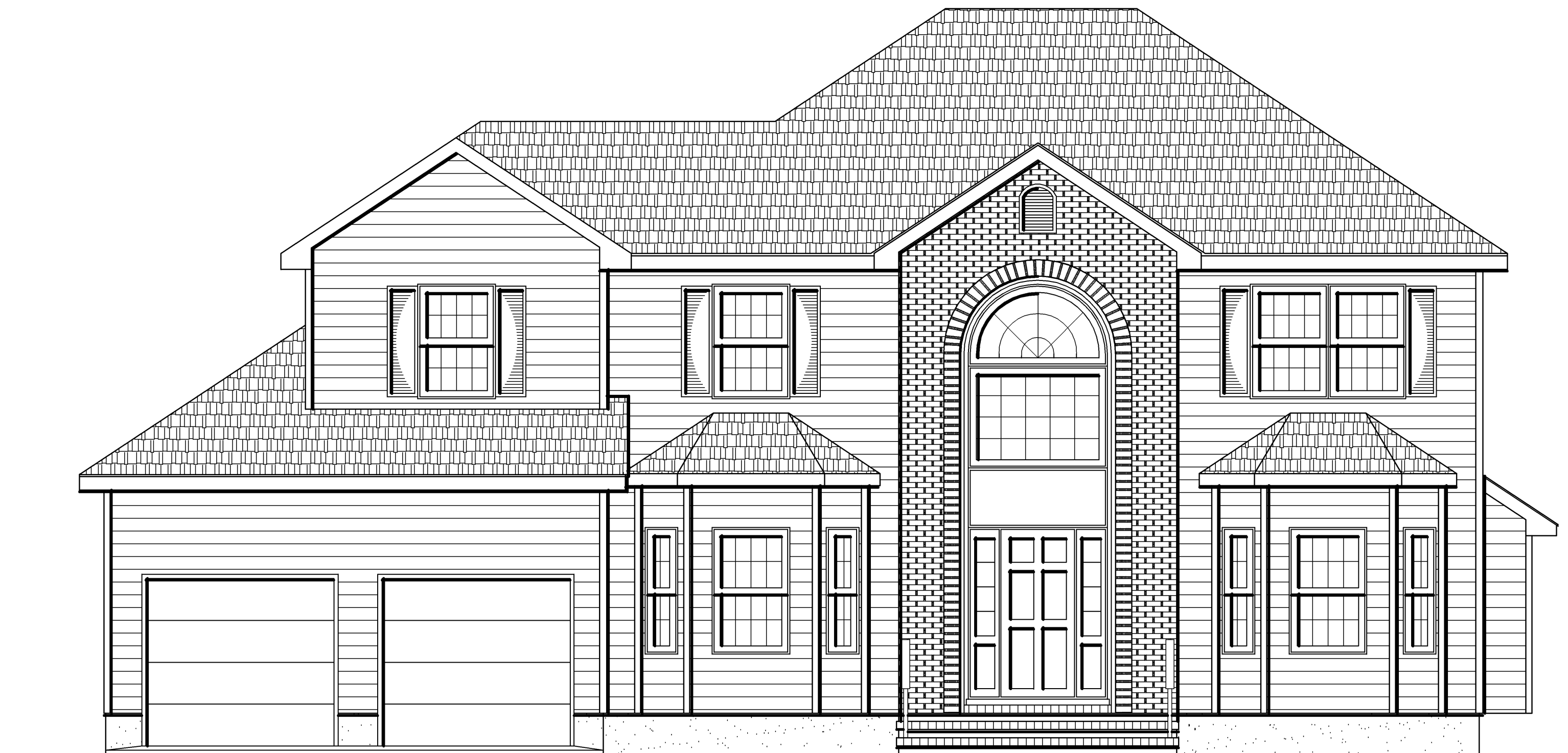
FRONT ELEVATION "THE BELMONT" — 2567 S.F.